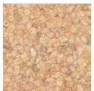
CMO WLI 06 10