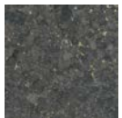
CMO WLI 06 69