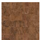
CMO WLI 07 72