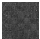
CMO WLI 07 69