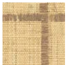
CMO WRA I2 72