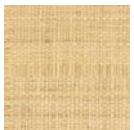
CMO WRA 12 10