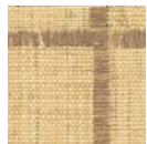
CMO WRA I2 72