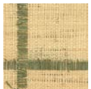
CMO WRA I2 69