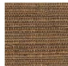
CMO WRS 04 75