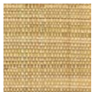
CMO WRS 04 10