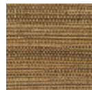
CMO WRS 04 72