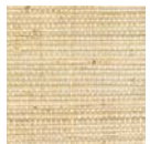
CMO WRS 04 01