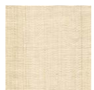
CMO FAB 01 01