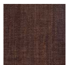
CMO FAB 01 70