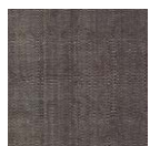
CMO FAB 01 82