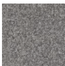
CMO FAL 04 82