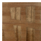
CMO WBO I2 74