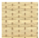
CMO WPA 09 74